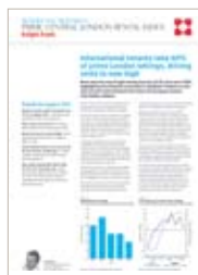
Prime London Lettings Index August 2011