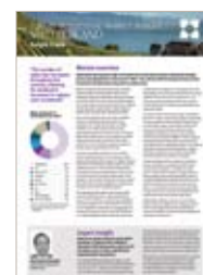
Switzerland Insight Report 2011