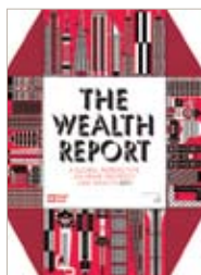
The Wealth Report 2011