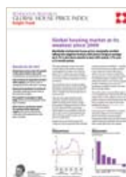
Global House Price Index Q2 2011